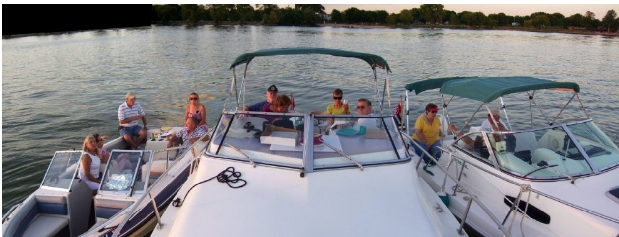
The August Third Thursday Raft-Up on Lake Monona near Olbrich Park Launch