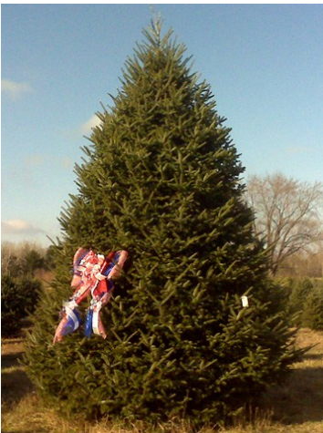
Schroeder Award Winning Tree

Did you know that the official White House Christmas tree this year comes all the way from Wisconsin.