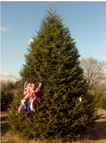
Schroeder Award Winning Tree

Did you know that the official White House Christmas tree this year comes all the way from Wisconsin.