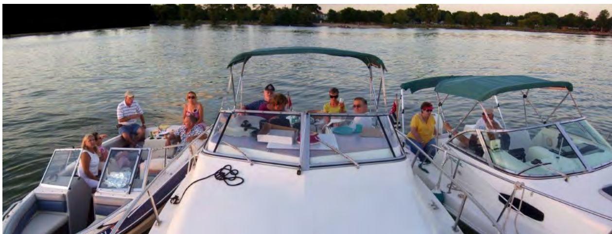
The August Third Thursday Raft-Up on Lake Monona near Olbrich Park Launch