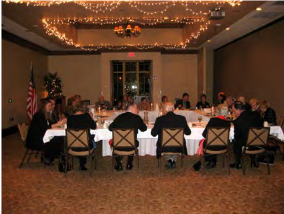
Dinner in the lovely dinning room at Stone Harbor Resort.