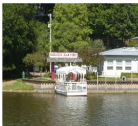
The Chain Ferry at Saugatuck