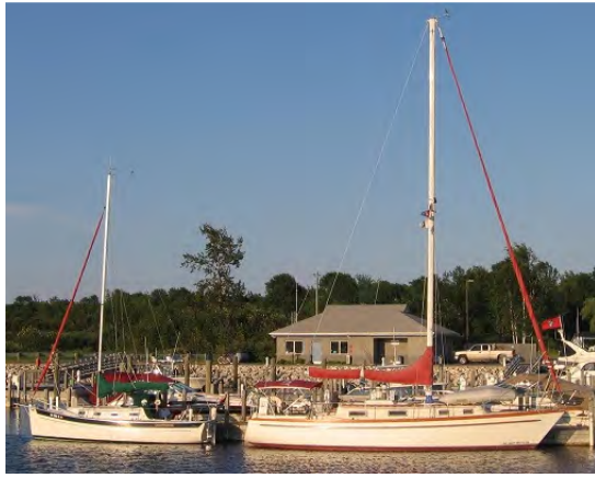
Compromise & Sankaty @ Cedar River