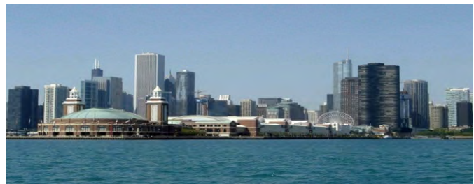
Navy Pier and the Chicago skyline

was flat and we maintained our ideal cruising speed of 25 mph. Saugatuck was festive and our marina was on the edge of town.