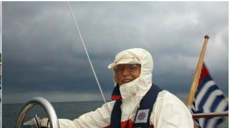
Wet but happy

Markus also sent along a video clip of us motoring along at: http://youtu.be/b2L-yIkOTnk