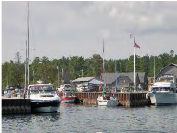
Compromise (the little one) in Jackson Harbor Notice the step up is at eye level