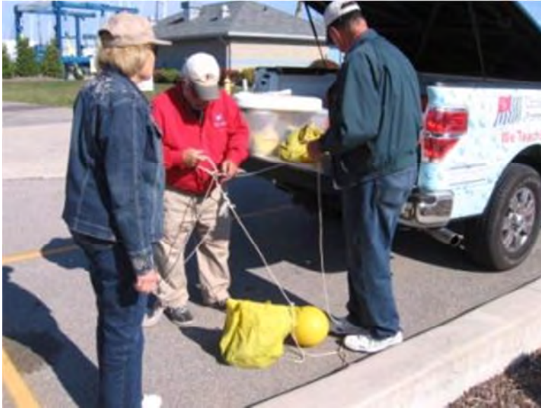
Setting up for an Inland Certification Run

--A few more photos courtesy of Markus Ritter---