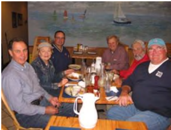
Relaxing at the Steel Bridge Café