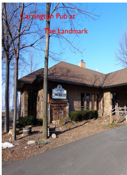
Carrington Pub at The Landmark