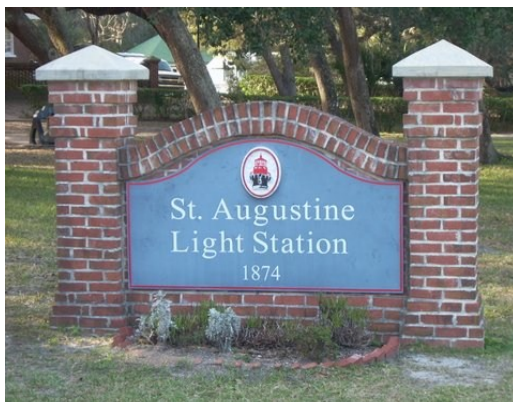
Location of the light pictured on Page 1