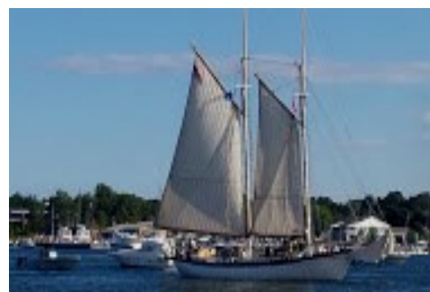
The Appledore IV