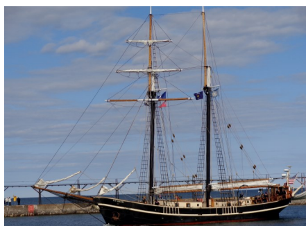
The Unicorn with it's all-female crew aboard