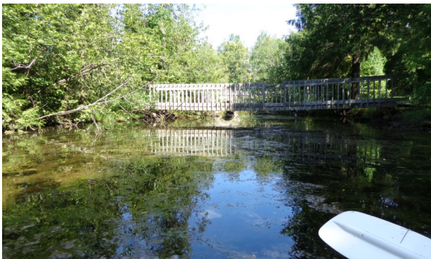
Logan Creek—just beyond the footbridge is the culvert under Hwy. 57

From the launch ramp, the group paddled the south shore to the protected State Natural Preserve. Then followed Logan Creek to Hwy. 57, where the creek ceases to be navigable.