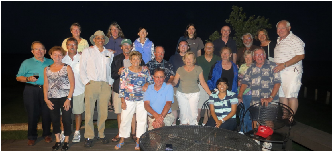
While we were only 14 on Friday night at the potluck, by Saturday we had grown to 24 people enjoying dinner at Berg's Landing..