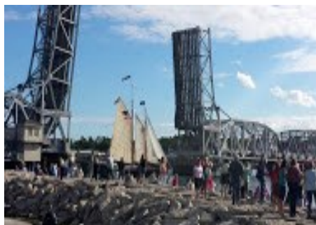
The Hindu coming through the Michigan Street bridge