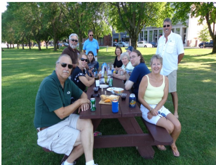
Enjoying Happy Hour in the shade of the park