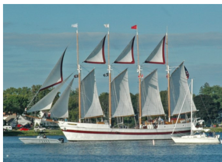
The beautiful, Windy, Chicago's flagship