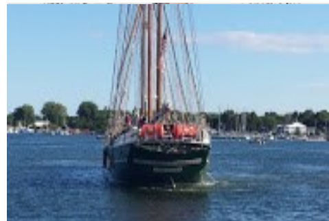
The Denis Sullivan, Milwaukee's flagship