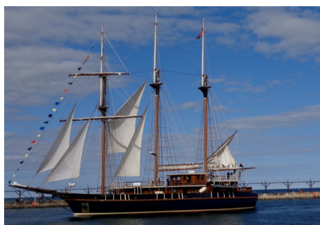
The Peacemaker arrives