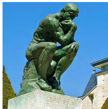
The Thinker by Auguste Rodin