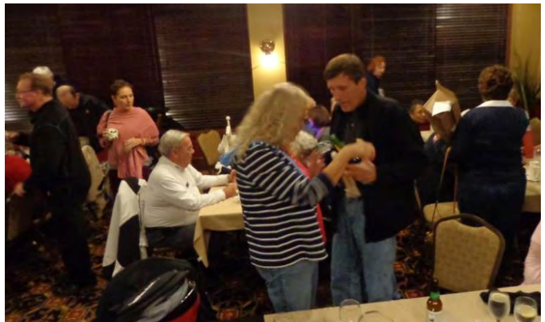
RIGHT: GUESTS TRADE WHITE ELEPHANT GIFTS AT THE FRIDAY NIGHT PARTY — IT WAS ONE HOUR OF MAYHEM