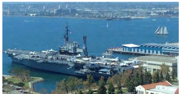
The USS Midway