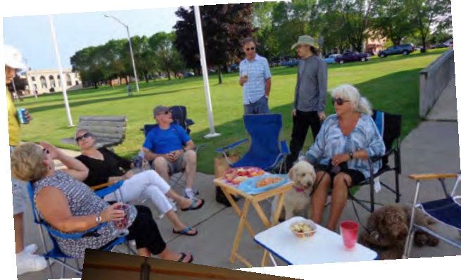
Happy Hour on the dock