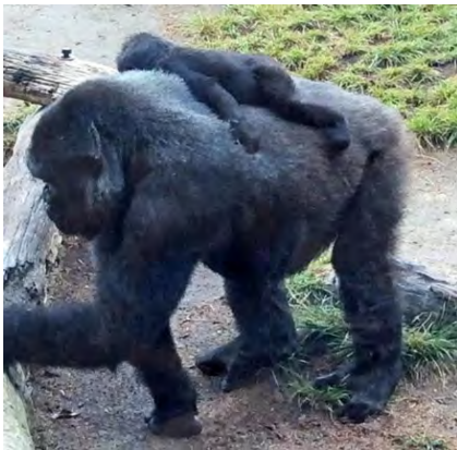
An old friend at the San Diego Zoo