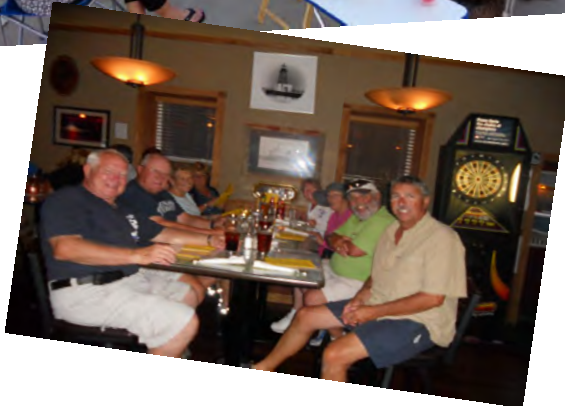
Friday night at the Ogden Club