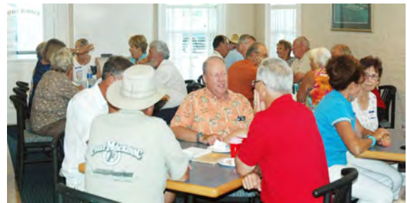
Saturday night at the potluck