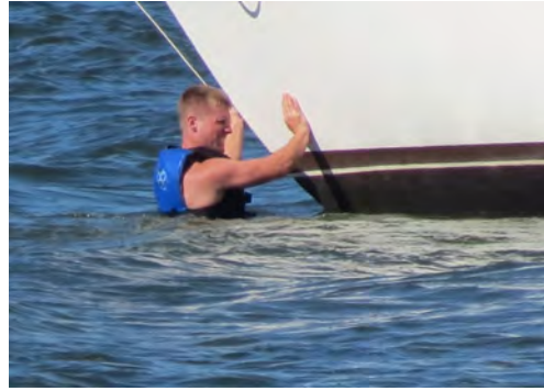
Attempting to push Lion's Paw off the sandbar