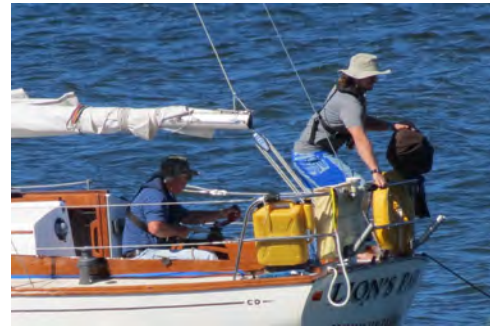
Lion's Paw underway