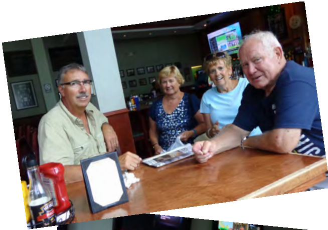
The Lunch Bunch at Murray's