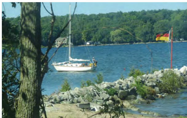
Lion’s Paw coming out of the lagoon

Now this would have been a simple case of not reading the water and wind conditions properly, and I would have chalked the incident up to bad luck that happened to a very experienced sailor who had been all over the lake with his boat. BUT that’s not the end of the story. The Captain took Lion’s Paw to the east of Green Island on his way to Menominee. If you have examined a chart of Green Island you will note that there is a green can about a mile off the western tip of the island that marks a spit. This means don’t sail between the can and the island! Well, you’ve probably surmised by now that our captain didn’t consult the chart or his chartplotter, so for the second time in one day, Lion’s Paw went aground. Fortunately, the captain and crew were able to swing the boom out and put enough weight on it to heel the boat and get her off. The overall lesson? Read your charts and the wind and water to stay out of trouble! This of course comes from the man who put Windrover aground on clearly marked Dunlap Reef just last year. Just sayin’. So to sum up, taking courses like Weather and Piloting are not enough. We need to practice what we learn in the classroom on the water as our two stories illustrate.