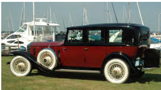
1928 Rolls Royce—a favorite at the classic car show

That evening members split up to dine out. They went to Berg's Landing, Murray's and Ogden Club.