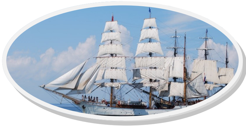
Tall ships return to Green Bay

The ships will arrive in Green Bay on Thursday and the rendezvous will kick off Friday at the Green Bay Yacht Club. Then Saturday you can take in the Tall Ship Festival and/or other venues around Green Bay. Dinner will follow Saturday night at The Rock Garden/Comfort Suites. At this time there will be nine ships in the event.